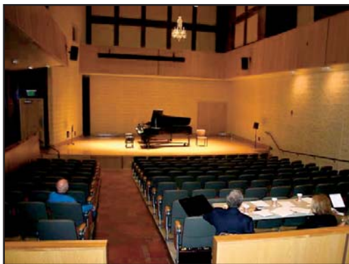
The recital hall at the Rhinehart Music Center.