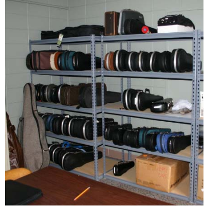
Friends inventory of available instruments - J. McFann

As we start out the 2011-2012 school year, the following instruments have been loaned: 1 - 1/16 violin, 5 - 1/4 violins, 9 - 1/2 violins, 6 - 3/4 violins, 7 full size violins, 9 cellos, 3 flutes, 1 oboe, 3 violas, 2 saxophones, and 2 trumpets for a total of 48 instruments. Thankfully, 9 of these instruments have been placed with families new to the program. The purchase of a new 1/2 size cello is now completed and placed with a student who is a Friends scholarship student. Since then, 9 more instruments were placed for a total of 57.